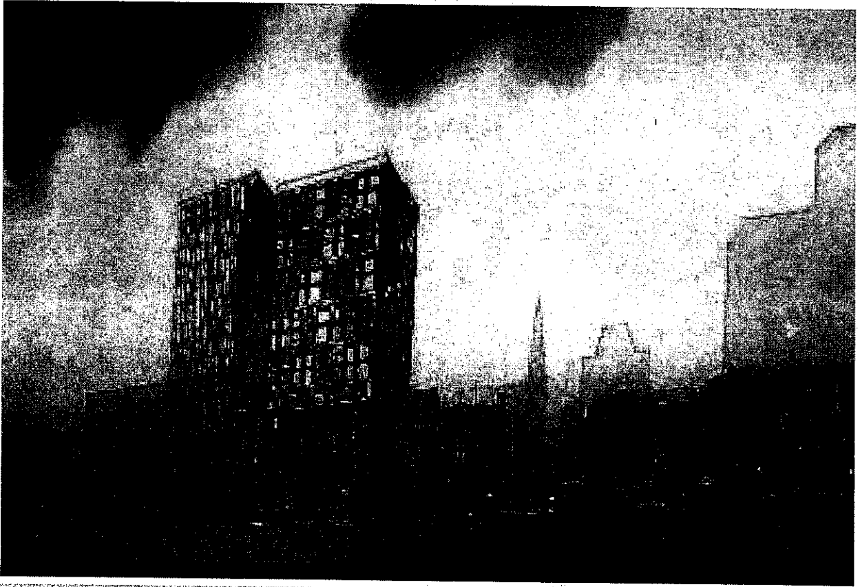
Stamper Square view from Penn's Landing