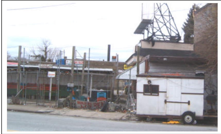
1900 block of Stenton Avenue.