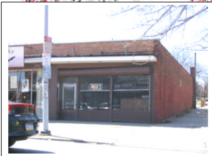
Vacant commercial building on 6300 block of Stenton Avenue.