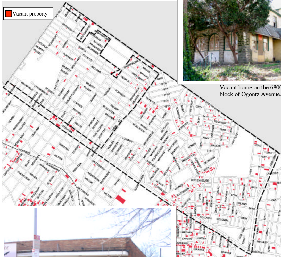
Vacant home on the 6800 block of Ogontz Avenue.

Vacant structures and lots are economically undesirable inasmuch as citywide experience has demonstrated that vacant properties have an increased likelihood of being long-term tax-delinquent. Residential property abandonment deprives the neighborhood, the city and the region of purchasing power, which erodes the local economy and results in reduced tax revenue to government.