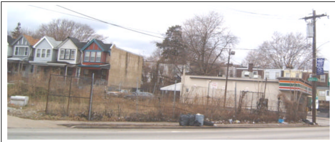
1600 block of Gratz Street at Stenton Avenue.

There is substantial evidence of economically undesirable land use throughout the study area. This criterion is primarily met within the study area by virtue of the 247 vacant properties and 1,459 code violations.