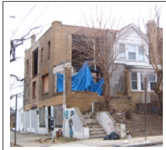
6400 block of 20 th Street.

Code violations are indicative of unsafe and inadequate conditions. In the census tracts that most closely mirror the study area boundary, there are 1,459 properties in violation of the City Housing Code as determined by the Department of Licenses and Inspections. Code violations exist for 14% of the properties in the study area. Additionally, overgrown vegetation, trash, sealed buildings and lack of activity make the area appear unsafe. (Source: University of Pennsylvania Neighborhood Information System (NIS), and L & I, 2005.)