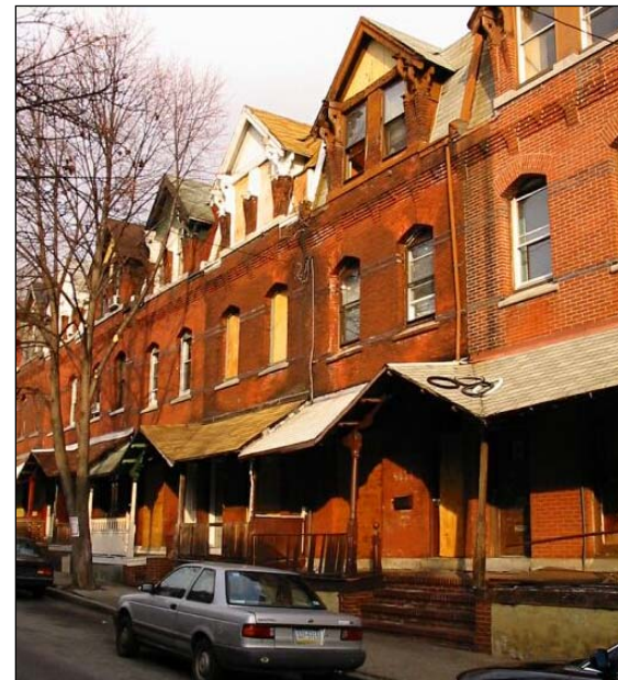
4400 block of Sansom Street, north side