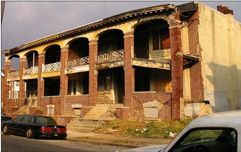
4600 block of Sansom Street, north side

Vacant Properties: The area contains 151 separately-titled properties. Recent field surveys indicate that 55, or over 36% of the properties are vacant (see “Vacancy” map, page 3). Included among the vacant properties are 46 vacant structures and 9 vacant lots.