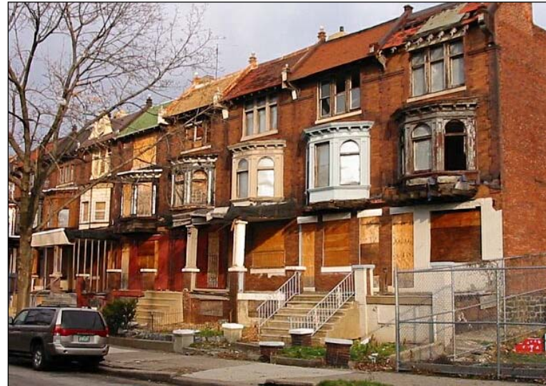
4500 block of Sansom Street, north side

NOW THEREFORE on this twentieth day of February 2002, the Philadelphia City Planning Commission hereby finds, based upon its staff report dated February 2002 that the area bounded by 44th Street, Chestnut Street, Farragut Street and Walnut Street exhibits the following characteristics of blight as established by Pennsylvania Urban Redevelopment Law: