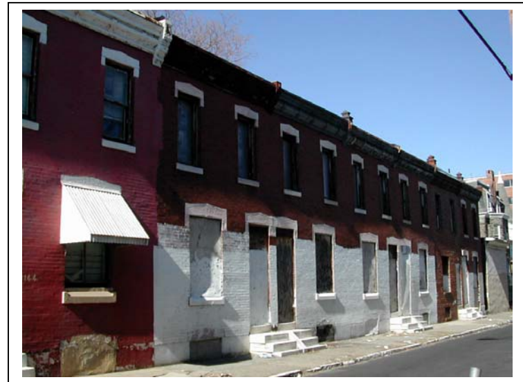
Vacant structures on Rosewood St.