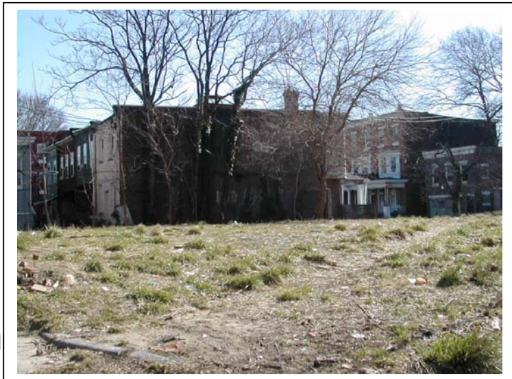
Vacant Lot on N. 15 th St.