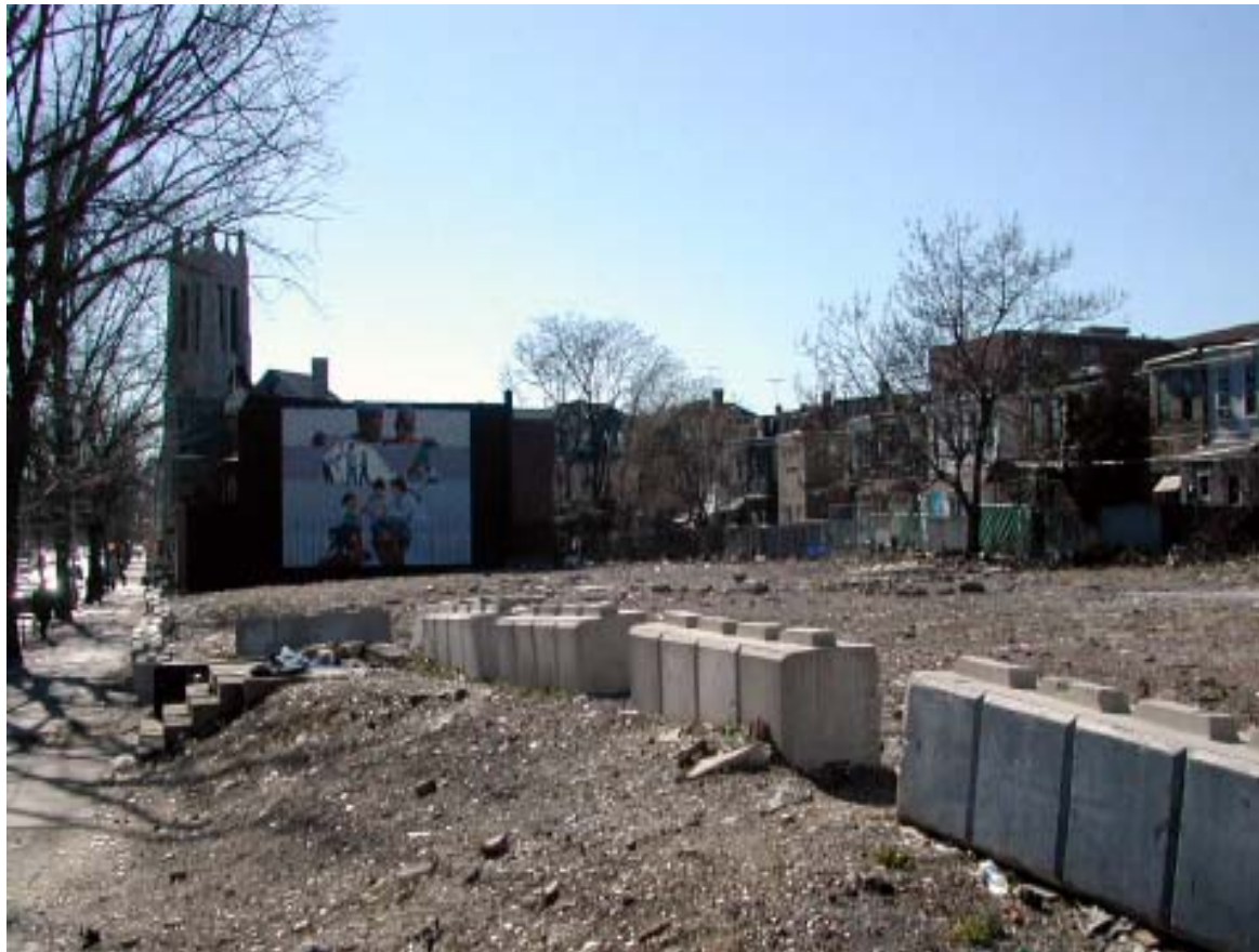
3200 N. Broad Street looking South

This Blight Recertification is intended to facilitate development on the 3100 and 3200 blocks of North Broad Street. Recertification is driven by two development proposals: the McDonald's Manager Training Facility at 3100 North Broad, and Overbrook Investment Partner's mixed use commercial / retail office building at 3200 N. Broad Street.