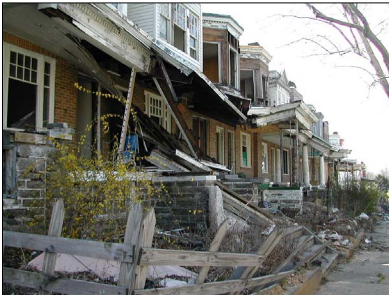
Unsafe and vacant buildings on Hutchinson Street.

There is substantial evidence of economically undesirable land use throughout the study area. Tax delinquency represents economically undesirable land use. When real estate taxes are not paid, the owners of properties are benefiting from municipal services without contributing to the