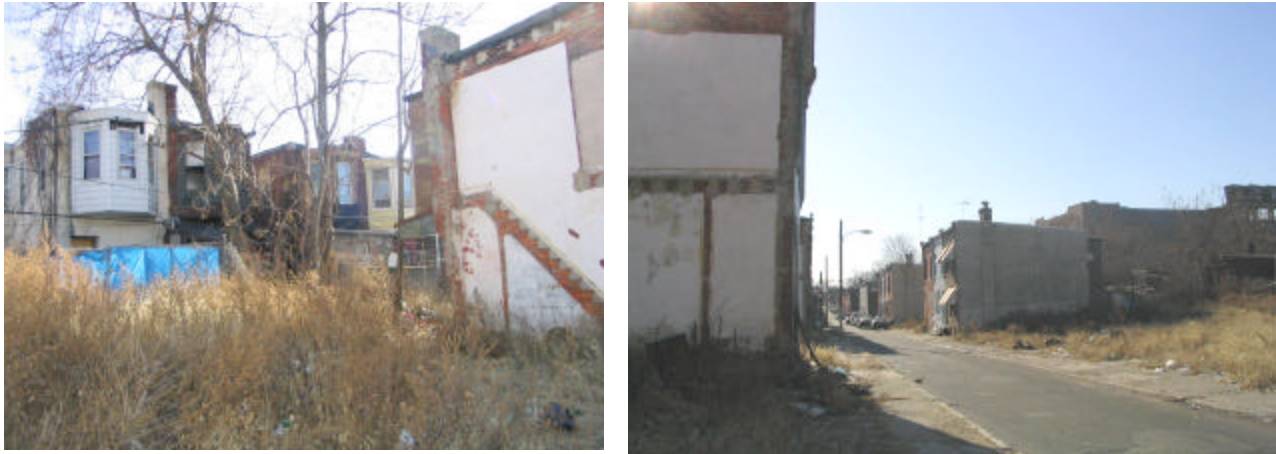
Examples of vacancy on 1400 block of N. Myrtlewood Street

Evidence of blight in the area is presented by the presence of a significant number of vacant structures and the existence of numerous vacant, trash-strewn lots. These conditions meet two criteria for blight certification: