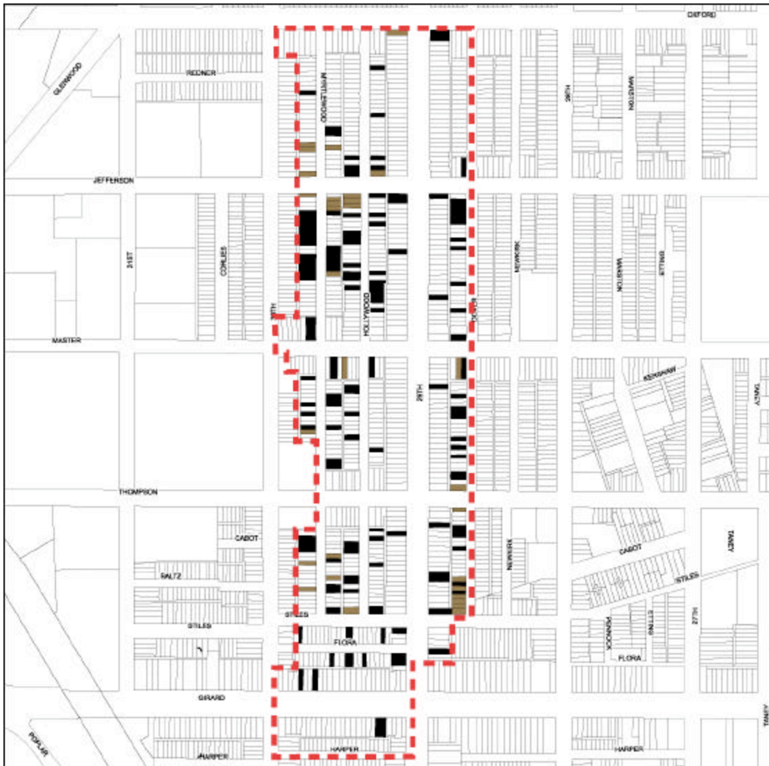
Vacancy ■ Vacant Lots ■ Vacant Buildings

Vacant structures and lots are socially undesirable for a number of reasons: they degrade the overall physical environment of the neighborhood and reduce the area's vitality. The presence of numerous abandoned properties puts the vacant properties as well as the surrounding area at increased risk for vandalism, arson, and other crimes. The increased threat of arson is a hazard that affects both vacant buildings and adjoining, occupied structures in the neighborhood. Furthermore, many of the vacant buildings in this area are structurally deteriorated and pose a danger to passersby or people who might trespass on the property.