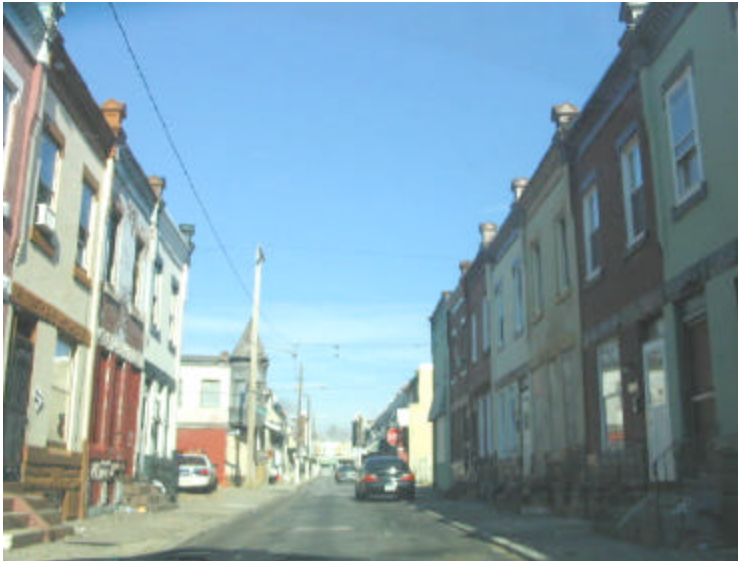
Narrow street conditions on the 1300 block of N. Hollywood